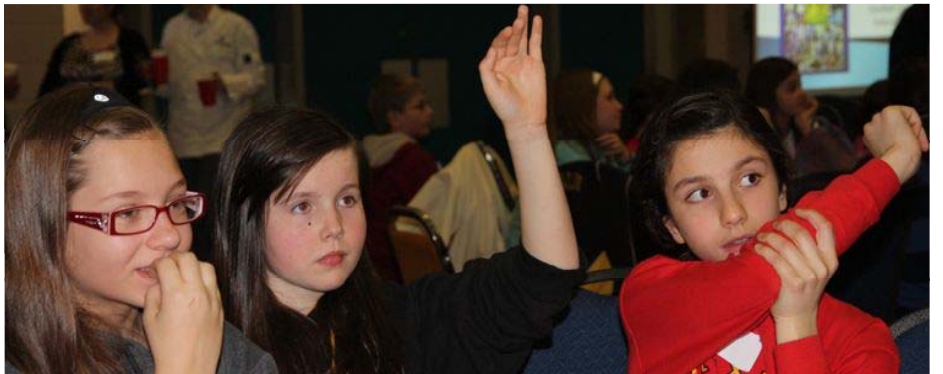
Students participate in a discussion about Catholic Education during Niagara Catholic's 3rd Annual Student Symposium at Holy Rosary Hall on February 23rd.